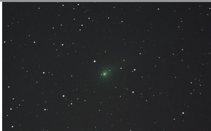
ER61 PanSTARRS. See faint tail.

because as comets go, anything can happen. Or, it could easily fizzle out as it approaches the Sun; we'll see.