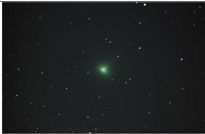
2017 E4 Lovejoy

Comet PanSTARRS is sporting a faint, and short, dust tail now. Comet Lovejoy also has a tail. It's a very thin ion tail pointing 1 degree to the upper right (west), but barely visible in my image. I needed a longer exposure in a darker sky, but I had to wait for it to clear a tall cottonwood to my East, and twilight was in full force at 6:23 am.